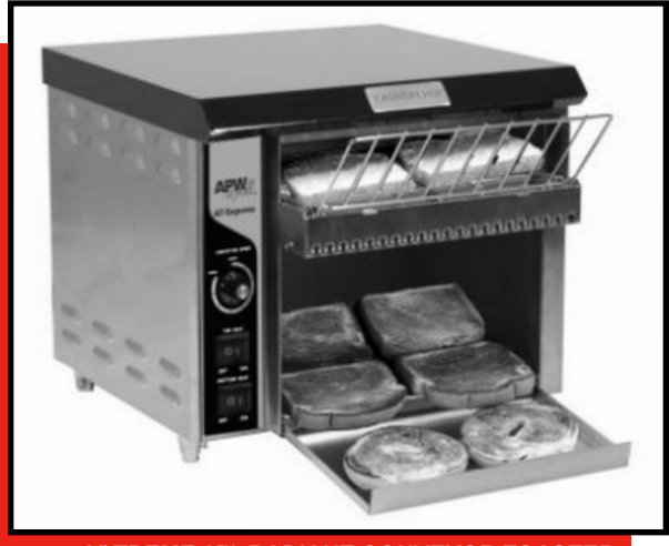
X*TREME-3™ RADIANT CONVEYOR TOASTER