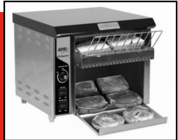
X*TREME-2™ RADIANT CONVEYOR TOASTER

See reverse side for product specifications.